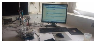
Figure 1: Electrochemical cell system potentiometric measurements and chronopotentiometry method with three electrodes system, based on a potentiostat type VMP3. Figure 1 represents the photo of test experiment

In this study, the electrode was immersed in 1M potassium chloride (KCl) solution with applying currents of either 0.2 or 1.0 mA for 2min. The performance of Ag/AgCl electrode was confirmed by