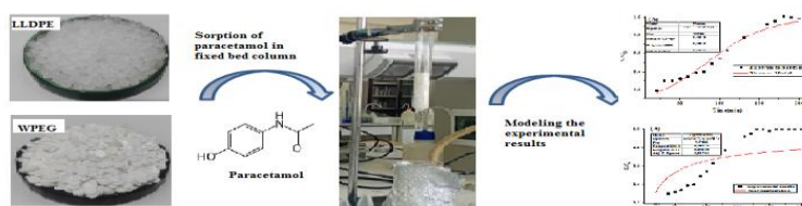
Figure1: Paracetamol dynamic sorption in fixed bed column

This present research relates to a comparative study of the dynamic sorption of paracetamol in a fixed bed column on a new category of sorbents based on a very available material which is "granulated polyethylene waste (WPEG)" and linear low-density polyethylene. The study is carried out by examining the effects of different parameters such as: pH, bed height and paracetamol concentration. Under the used conditions, all obtained results showed that the highest removal efficiency is obtained under the following optimal parameters ( C_0=4\text{mg/L} , Q=2\text{mL/min} , H=7\text{cm} , \text{pH}=3 ). Thomas and Ogata-Bank models were used for modeling the optimal results. It was noticed that the Thomas method predicts the experimental results well with a correlation coefficient considered very satisfactory (0.96). The maximum sorption capacity obtained by the sorbent based on granulated polyethylene waste is approximately 115 mg/g, thus showing the great effectiveness of this sorbent in the elimination of paracetamol.