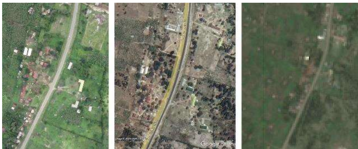
Figure 2: Comparison of images containing crop fields in southern Uganda acquired by three remote sensing platforms with different spatial resolutions.

From left to right in figure 2: drone image (4 cm/pixel, taken by author CLA in 2016), CNES/Airbus base map in Google Earth (0.5 m/pixel, from 2021 base map), and Sentinel 2 image (10 m/pixel, acquired 2021). Banana and maize crops can be identified in the drone image but not the CNES/Airbus or Sentinel-2 satellite images. Other crops known to be present from ground-truth observation, such as beans and sweet potatoes, cannot be identified from satellite images.