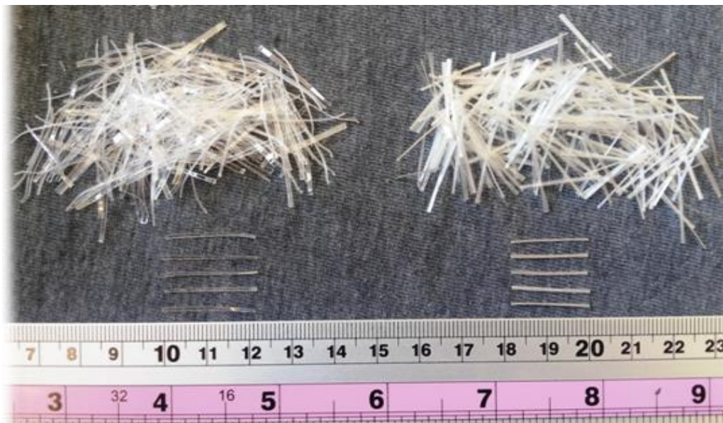
Figure 2: Comparison between PET (left) and PP (right) fibres