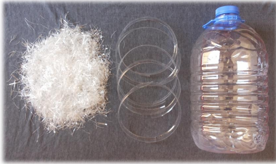
Figure 1: Preparing of PET from plastic bottles