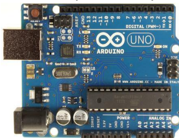
Fig 1. Arduino Uno Board

The Arduino Uno is a microcontroller board based on the ATmega328p [9]. It is simple, inexpensive, open source prototyping platform extensible to hardware and software. It has 14 digital input/output pins (of which 6 can be used as PWM outputs), 6 analog inputs, a 16 MHz ceramic resonator, a USB connection, a power jack, and a reset button. It contains everything needed to support the microcontroller. We either need to connect it to a computer using a USB cable or power it with an AC-to-DC adapter. The Arduino circuit acts as an interface between the software part and the hardware part of the project.