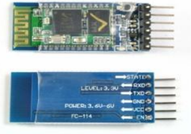
Fig 2. Bluetooth HC-05 Module